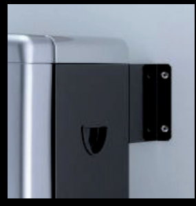
Wall bracket kit For added security, use the wall bracket set to anchor your watercooler back to the wall. Simple to fit and unobtrusive.