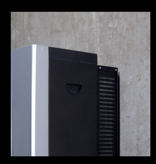
Rear cover kit Tamper-proof rear cover anchors the appliance to the wall and protects plumbing and electrical connections. Ideal for public areas.